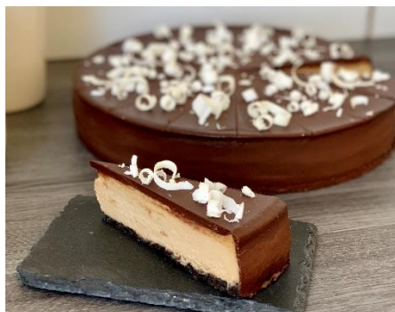
Cappuccino Cheesecake Code – 4962 / 2 pack

Cappuccino flavored cheesecake made with mascarpone cheese, chocolate ganache, and topped off with white chocolate shavings.