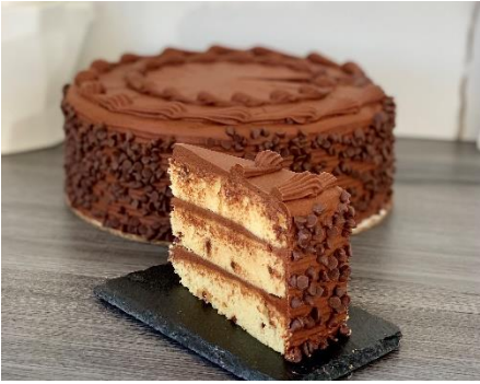
Banana Fudge Chocolate Chip Code – 4246 / 2 pack

Banana and chocolate... the ultimate comfort food. Moist banana chocolate chip layers combined with the taste of real fudge icing.