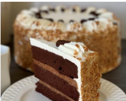
Heath & Chocolate Mousse Cake Code – 4275 / 2 pack

A chocolate dream come true! Dark and delicious cake layers alternate with rich chocolate mousse and Heath Bar pieces. Iced with real whipped cream, decorated with whipped chocolate ganache and sprinkled generously with Heath Bar pieces.