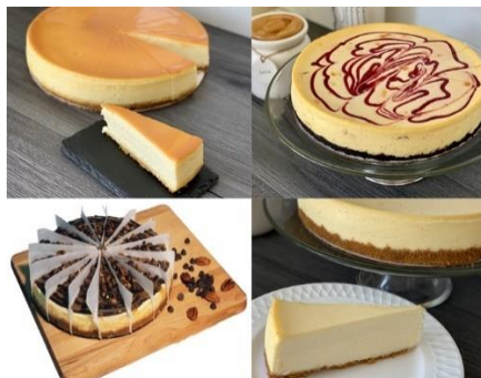
Variety Cheesecake Code – 4932 / 4 pack

Have it ALL with the variety pack! Includes one of each: Plain, Raspberry Swirl, Turtle, and Crème Brulee cheesecakes.