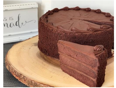
Grandma's Chocolate Cake Code – 4278 / 2 pack

A moist three-layer cake laden with carrots and pineapple, accented with a touch of cinnamon, covered with velvety smooth cream cheese icing and walnuts on the sides. This cake is the essence of down-home delight. Hand decorated and pre-scored for 16 servings.