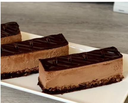
Chocolate Crunch Code – 84294 / 3pk

Crunchy chocolate base, rich chocolate mousse, covered in dark chocolate glaze. Pack of 3 strips 16" x 4" 12 servings per strip (suggested size)