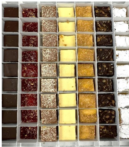
Sweet Table Assortment