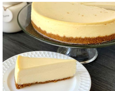
Plain Cheesecake Code – 4936 / 2 pack

You will not find a creamier cheesecake! A classic staple made from scratch using fresh, delicate ingredients. The graham cracker crust is a perfect flavor and texture enhancement. Add your own special topping for a unique presentation.