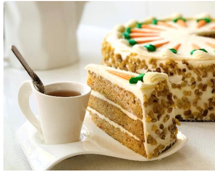
Carrot Cake Code – 4281 / 2 pack

A moist three-layer cake laden with carrots and pineapple, accented with a touch of cinnamon, covered with velvety smooth cream cheese icing and walnuts on the sides. This cake is the essence of down-home delight. Hand decorated and pre-scored for 16 servings.