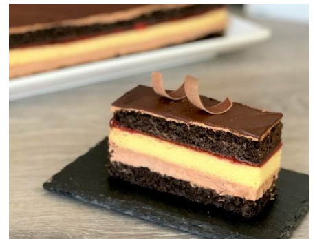
Chocolate Cherry Code – 84293 / 3pk

Tender yellow cake covered by succulent vanilla mousse with a layer of triple berry compote (raspberry, strawberry, blueberry). Topped with strawberry glaze. Pack of 3 strips 16" x 4" 12 servings per strip (suggested size)