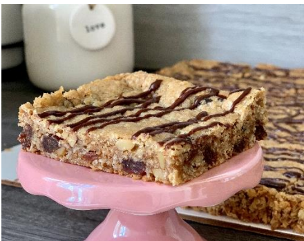
Oatmeal Walnut Raisin Bar Code – 6718 / 2 pack

You will love the way Oatmeal, Walnuts and Raisins are blended in this perfect bar! Chocolate is drizzled over the top to make this a favorite.