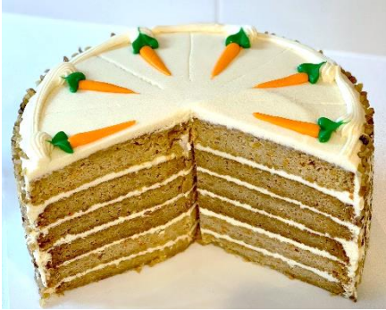
Colossal Carrot Cake