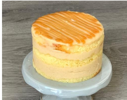
Southern Caramel Code – 84297 / 20 pack / 5.2 oz

Dark chocolate layers, chocolate icing, and milk chocolate shavings. An all-chocolate paradise!