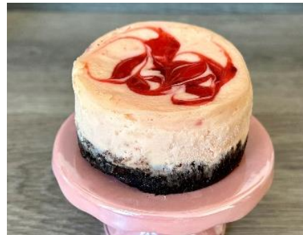
Raspberry Swirl Cheesecake

Chocolate ganache, pecans, and caramel in combination with an already rich cheesecake have made this an all-time favorite dessert!