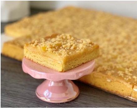
Apple Butter Crumb Bar Code – 6712 / 2 pack

A dense layer of chewy blondie brownie, topped with a generous portion of apples and sprinkled with golden butter crumb.