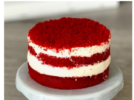
Red Velvet Code – 82635 / 20 pack / 4.5oz

Chocolate layers surround the duet of whipped raspberry cream and homemade raspberry filling. Topped with chocolate ganache and whipped raspberry cream.