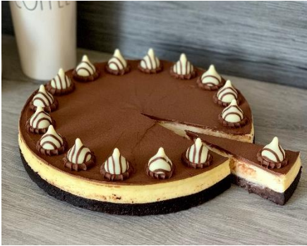
Truffle Cheesecake Code – 4957 / 2 pack

Chocolate fudge, cheesecake, and Hershey Hugs for each serving. A truly unique combination!