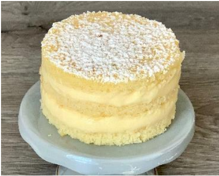
Italian Lemon Code – 84286 / 20 pack / 4.8oz

This sweet treat is made of tender yellow cake layers filled with Italian lemon cream and sprinkled with powdered sugar.