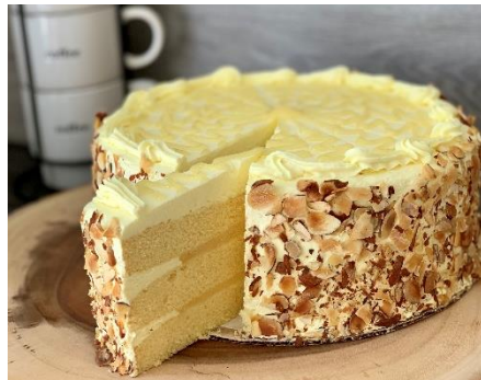
Lemon Sunburst Code – 4257 / 2 pack

As refreshing as a summer breeze! Golden yellow cake layers surround smooth lemony filling. Topped with delicious real lemon whipped cream and lemon decorations. Finished with a whipped cream border and toasted almonds on the sides.