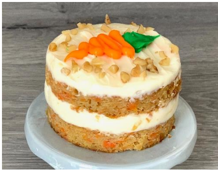
Carrot Cake Code – 82634 / 20 pack / 6.8oz

Chocolate lovers will never forget this dessert! A very special blend of finest Belgian chocolate with a pastry chef's decoration on each portion. Our Chef recommends serving this unforgettable dessert with your favorite puree; ie raspberry or strawberry.