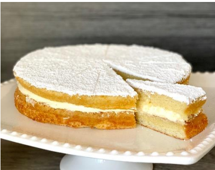
Italian Lemon Cream Cake Code – 4506 / 2 pack

This sweet treat is a 2 layer cake filled with Italian Lemon Cream.