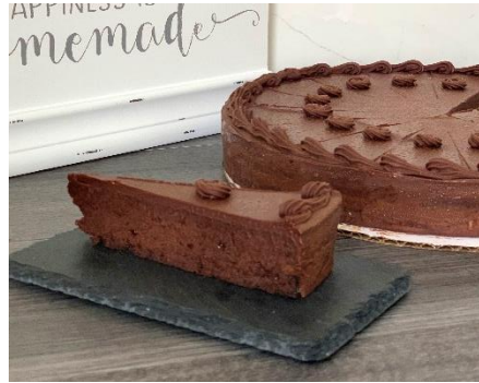
Chocolate Flourless (Gluten Free) Code – 4265 / 2 pack

Our very popular, super moist, dark chocolate cake layers surround a scrumptious cherry filling. The whole cake is then blanketed in delectable heavy whipped cream. And if that isn't enough, we decorate the top with cherries and sprinkle the sides with cake crumbs to create the perfect dessert. Pre-scored for 16 servings.