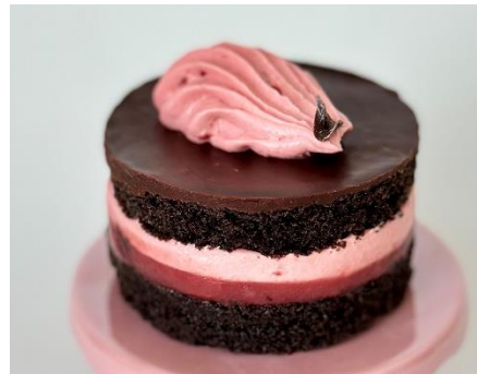
Chocolate Raspberry Code – 82638 / 20 pack / 5oz

Moist layers laden with carrots and pineapple, accented with a touch of cinnamon. Filled with velvety smooth cream cheese icing and sprinkled with walnuts. A classic at its best!