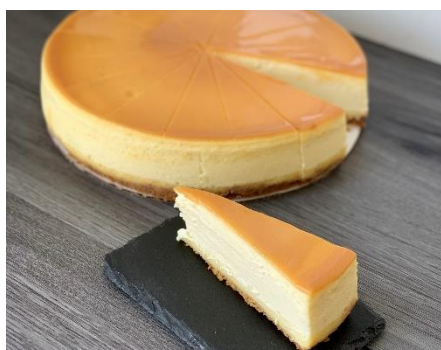
Crème Brûlée Cheesecake Code – 4913 / 2 pack (16 cut) Code – 84283 / 2 pack (14 cut)

Two great classics. The rich perfection of vanilla bean flecked Crème Brûlée layered with the lightest of plain cheesecakes to create something unimaginably luscious! Hand-fired and mirrored with burnt caramel. Too good to resist!