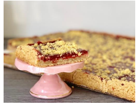
Raspberry Bar Code – 6750 / 2 pack

It all starts with a selection of the finest ingredients for the half-sheet base, which is then topped with 2 lbs. of raspberry filling. The butter crumb topping is the perfect finishing touch!