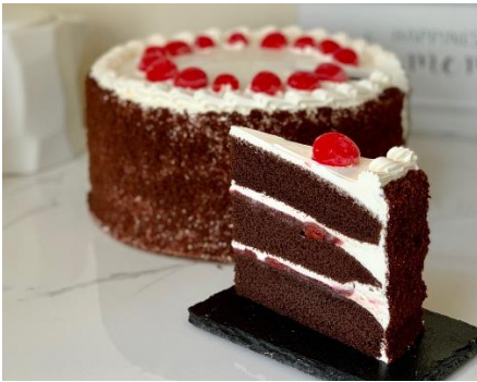
Black Forest Cake Code – 4263 / 2 pack

Our very popular, super moist, dark chocolate cake layers surround a scrumptious cherry filling. The whole cake is then blanketed in delectable heavy whipped cream. And if that isn't enough, we decorate the top with cherries and sprinkle the sides with cake crumbs to create the perfect dessert. Pre-scored for 16 servings.