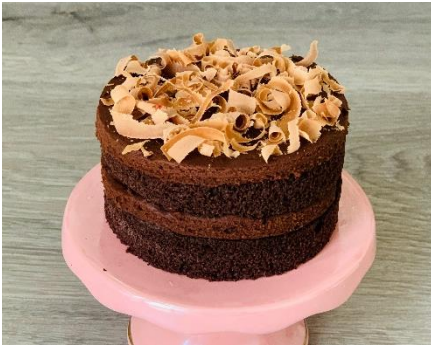
Grandma's Chocolate Code – 84295 / 20 pack / 5 oz

Dark chocolate layers, chocolate icing, and milk chocolate shavings. An all-chocolate paradise!