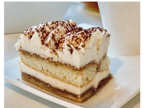
Tiramisu Code – 4346 / 2 quarter sheets

An authentic Italian dessert that is made from the finest mascarpone cheese, brandy, coffee liquor, and lady fingers. Each lady finger is gently soaked in espresso. We alternate between layers of lady fingers and rich filling, and then decorate the top with cocoa.