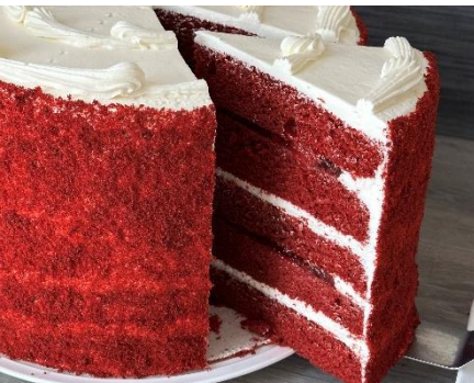
Colossal Red Velvet Strawberry