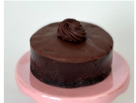
Chocolate Flourless Code – 82637 / 20 pack / 5 oz

German chocolate layers iced with a creamy coconut-walnut icing and sprinkled with walnuts and coconut on top. Too much to resist!