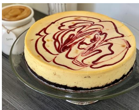
Raspberry Swirl Cheesecake Code – 4954 / 2 pack

This rich cheesecake with a swirl of a real raspberry filling that gives it a unique look and flavor. The scrumptious chocolate cookie crust creates the perfect combination.