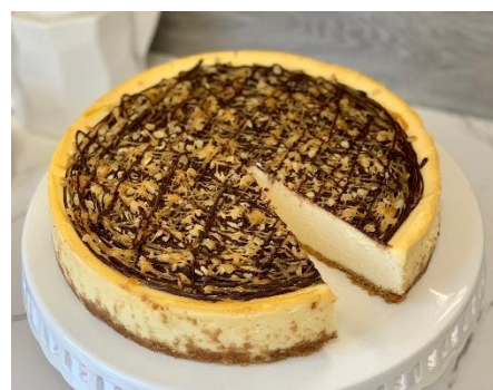
Turtle Cheesecake Code – 4346 / 2 pack

Chocolate ganache, pecans, and caramel in combination with an already rich cheesecake have made this an all-time favorite dessert!