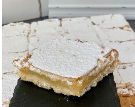
Lemon Bar Code – 6741 / 2 pack

Short bread is one of the pastry chef's favorite ways to start a dessert bar, and that's the foundation of this tasty item. Topped with a layer of tart lemon filling and generously sprinkled with powdered sugar.