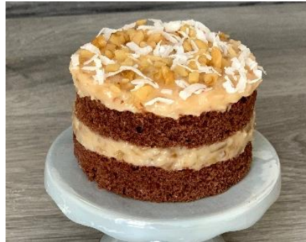
German Chocolate Code – 84287 / 20 pack / 5.1oz

This sweet treat is made of tender yellow cake layers filled with Italian lemon cream and sprinkled with powdered sugar.