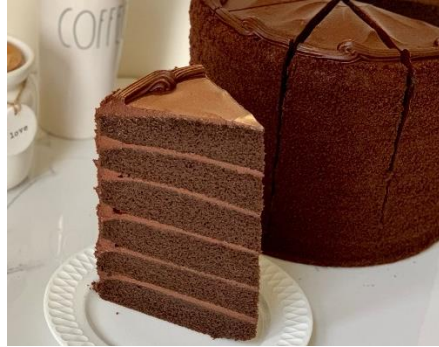
Colossal Grandma's Chocolate