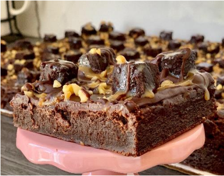
Turtle Brownie Code – 4681 / 2 pack

A very dense chocolate fudge brownie that has been covered with a rich chocolate ganache and chunks of fudge pieces. Then drizzled with caramel and a generous amount of walnuts. Half sheet, uncut.