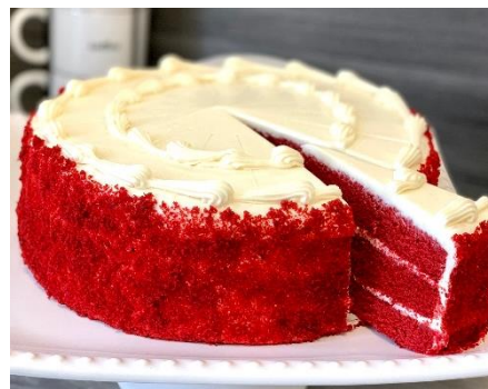
Red Velvet Code – 4955 / 2 pack

This moist, colorful confection is as fitting for the everyday as it is for special occasions. An ideal balance of light cream cheese frosting and Red Velvet layers will have you coming back for more!