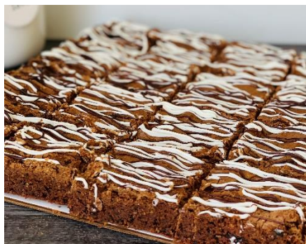
Cookies'N Cream Bar Code – 6723 / 2 pack

A rich layer of chocolate blended with a generous portion of cookie & cream cookies. The top is decorated with chocolate and white icing.