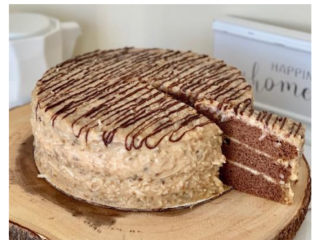
German Chocolate Cake Code – 4256 / 2 pack

A traditional cake that was developed for a special Milwaukee customer. German chocolate cake layers iced with a creamy coconut-pecan icing and decorated with a chocolate swirl. Too much to resist!