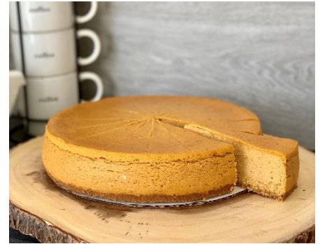
Pumpkin Cheesecake Code – 4975 / 2 pk SEASONAL

A popular holiday dessert made from scratch using plenty of fresh, delicate ingredients. Just the right amount of crushed peppermint candies and the chocolate cookie crust create the perfect flavor and texture! Finished with a border of heavy whipped cream. Pre-cut 16 servings w/paper inserts.