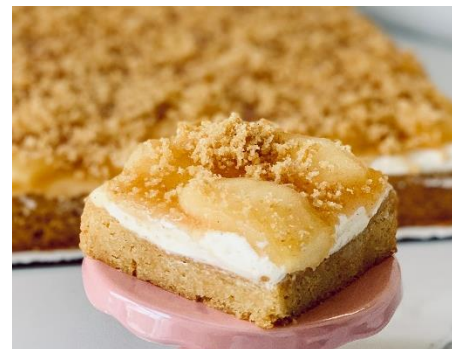
Apple Cream Cheese Blondie Code – 4620 / 2 pack

Generous portion of caramelized, sliced apples tops the cream cheese filling that is spread over a chewy blondie base. Finished off with delicious golden crumb sprinkle.