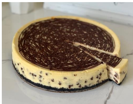
Chocolate Chip Cheesecake Code – 4934 / 2 pack

A very rich and creamy cheesecake with lots of chocolate chips and a chocolate cookie crust. The cheesecake is topped off with a special chocolate ganache that is made from imported chocolate.