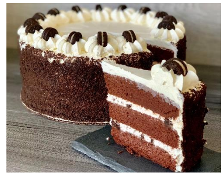
Cookies & Cream Cake Code – 4277 / 2 pack

Forever popular! Real whipped cream and Oreo cookie pieces are sandwiched between rich devil's food cake layers. Enough to bring a smile to young and old alike.