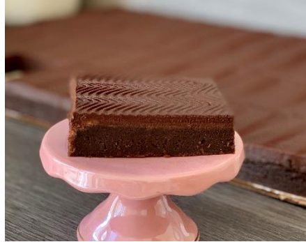
Fudge Ganache Brownie Code – 4661 / 2 pack

A very dense chocolate fudge brownie that has been covered with a rich chocolate ganache and chunks of fudge pieces. Then drizzled with caramel and a generous amount of walnuts. Half sheet, uncut.