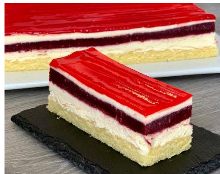
Ruby Pearl Code – 84292 / 3pk

Crunchy chocolate base, rich chocolate mousse, covered in dark chocolate glaze. Pack of 3 strips 16" x 4" 12 servings per strip (suggested size)