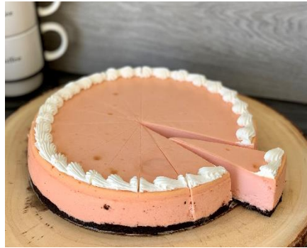
Peppermint Cheesecake Code – 4983 / 2 pk SEASONAL

A popular holiday dessert made from scratch using plenty of fresh, delicate ingredients. Just the right amount of crushed peppermint candies and the chocolate cookie crust create the perfect flavor and texture! Finished with a border of heavy whipped cream. Pre-cut 16 servings w/paper inserts.